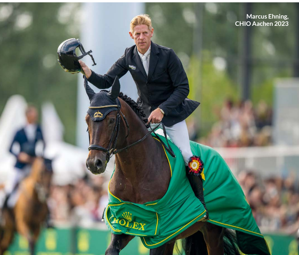
Marcus Ehning, CHIO Aachen 2023