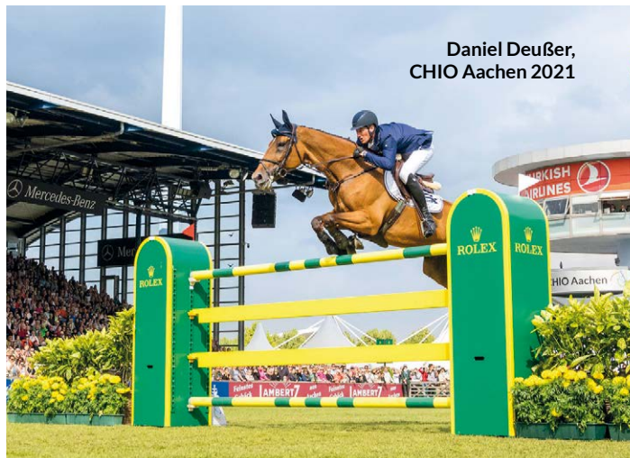
Daniel Deußer, CHIO Aachen 2021